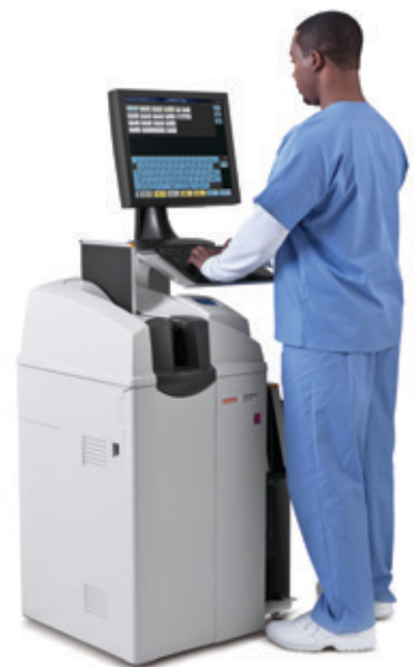
Ideal for use with CARESTREAM DIRECTVIEW CR Systems

The DRYVIEW 5950 Laser Imager is part of the industry's most complete diagnostic imaging portfolio. Carestream offers solutions for the entire imaging chain, including Computed Radiography (CR), Digital Radiography (DR), HIS/RIS, PACS, hardcopy digital output and traditional film and screen products. Choosing Carestream as your imaging partner makes it easy and affordable to meet your current needs and build for your future.